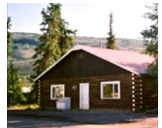
Liaison office - Ross River, YT