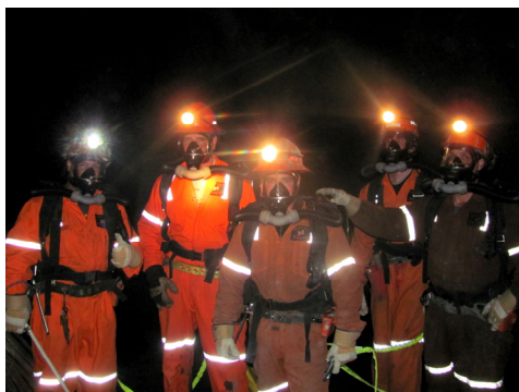
A group of mine rescue trainees

confined space entry, mill reagents, the surface safety card system and first aid. Mine Rescue training for certification was delivered to 15 employees from Yukon Zinc and Procon. Front Line Supervisor training is starting, which is a new Yukon WCB requirement.