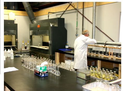
Testing in new assay lab