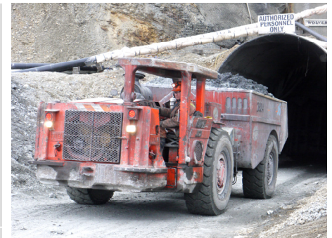
Loaded haul truck coming to surface